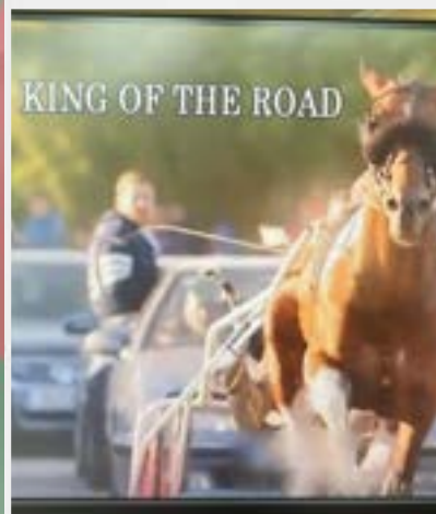
Lots of Singing!