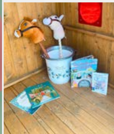
Hobby Horses & Joyo buckets!