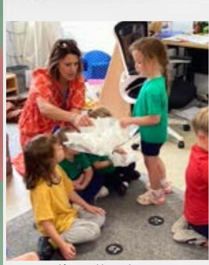
Tasting the bacon pudding in Reception