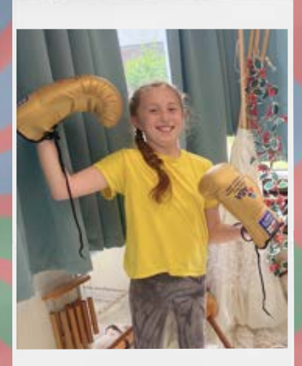
Dad's boxing gloves!