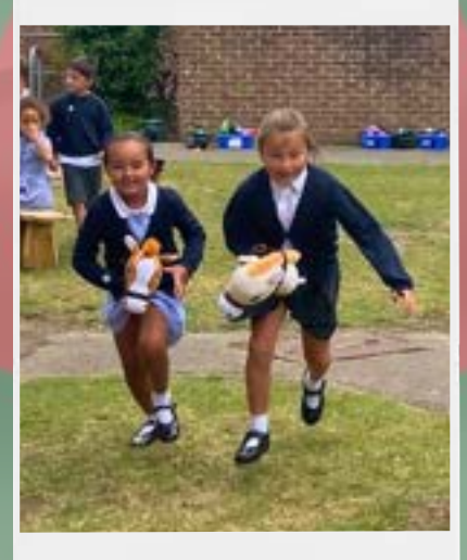
The Epsom Derby!