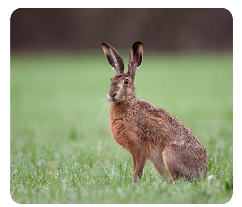
Animals have senses.

Animals are living things. They come in a wide variety of shapes and sizes. All animals are born, then they grow and change over time.