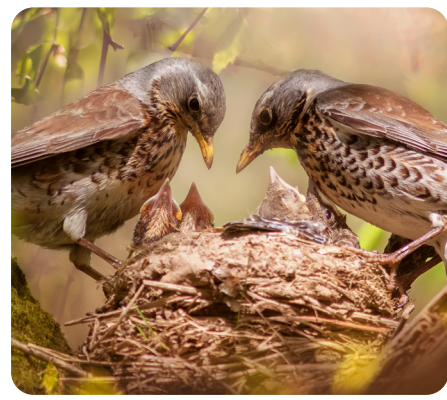
Animals have offspring.