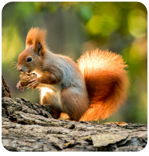
carnivores herbivores omnivores