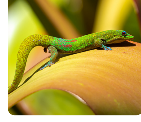
Animals get rid of waste.