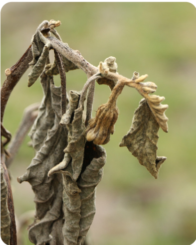
unhealthy aubergine plant